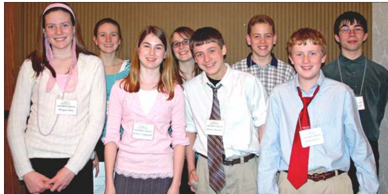
Students from St. Bernard Parish School in Louisville attended Catholics @ the Capitol to help raise legislators' awareness about the value of Catholic educational efforts in Kentucky

We educate 48,434 children in 98 Catholic elementary